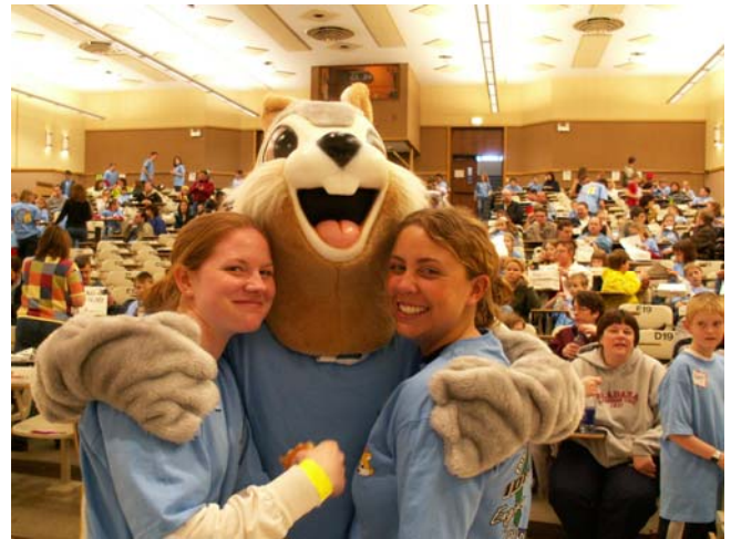
PESCy, what a player...

Greetings from Purdue University! Before I begin, let me introduce myself. My name is PESCy the Squirrel and I am the official mascot of the Purdue Engineering Student Council. I spend most of my days hanging out in the PESC office between regular appearances at PESC events and the occasional photo opportunity.